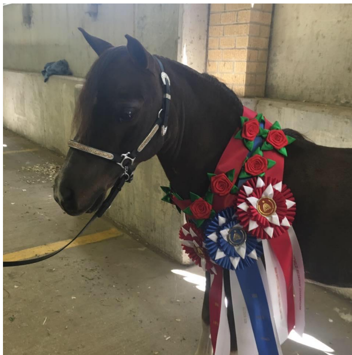
Regalo: COPtHA's 2017 High Point Halter Gelding

Pura Vida's Signature Silver Dollar Multiple World and Reserve World Championships at the AMHA World Championship show.